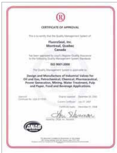
ISO 9001:2000 Certificate