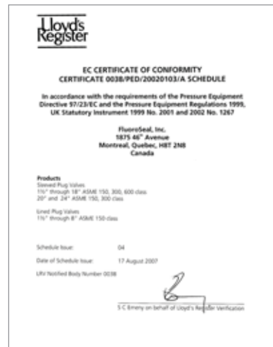
EC Certificate of Conformity